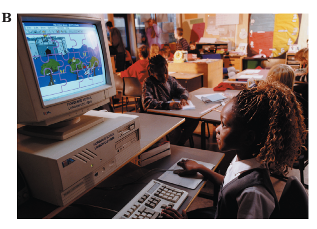
In which of the photos can you see these things?

mouse screen desk somebody ... asking thinking blackboard keyboard pen chair map explaining waiting